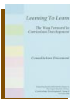
“Learning to Learn – The Way Forward in Curriculum Development” Consultation Document November 2000