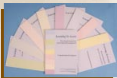
“Learning to Learn – The Way Forward to Curriculum Development” Consultation Documents