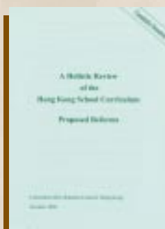
“A Holistic Review of the Hong Kong School Curriculum” Proposed Reforms Curriculum Development Council October 1999

(Reform Proposals for the Education System in Hong Kong 2000)